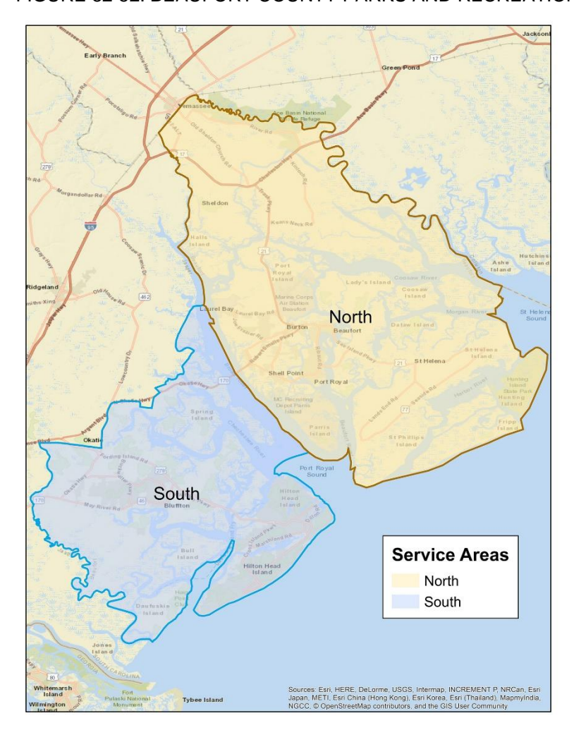
FIGURE 82-52: BEAUFORT COUNTY PARKS AND RECREATION SERVICE AREAS

There are two service areas for parks and recreation development impact fees. They are the South Beaufort County Parks and Recreation Service Area and the North Beaufort County Parks and Recreation Service Area. The South Beaufort County Parks and Recreation Service Area includes those parts of the County south of the Broad River. The North Beaufort County Parks and Recreation Service Area includes those parts of the County north of the Broad River. The boundaries of these services areas are identified in Figure 82-52: Beaufort County Parks and Recreation Service Areas.