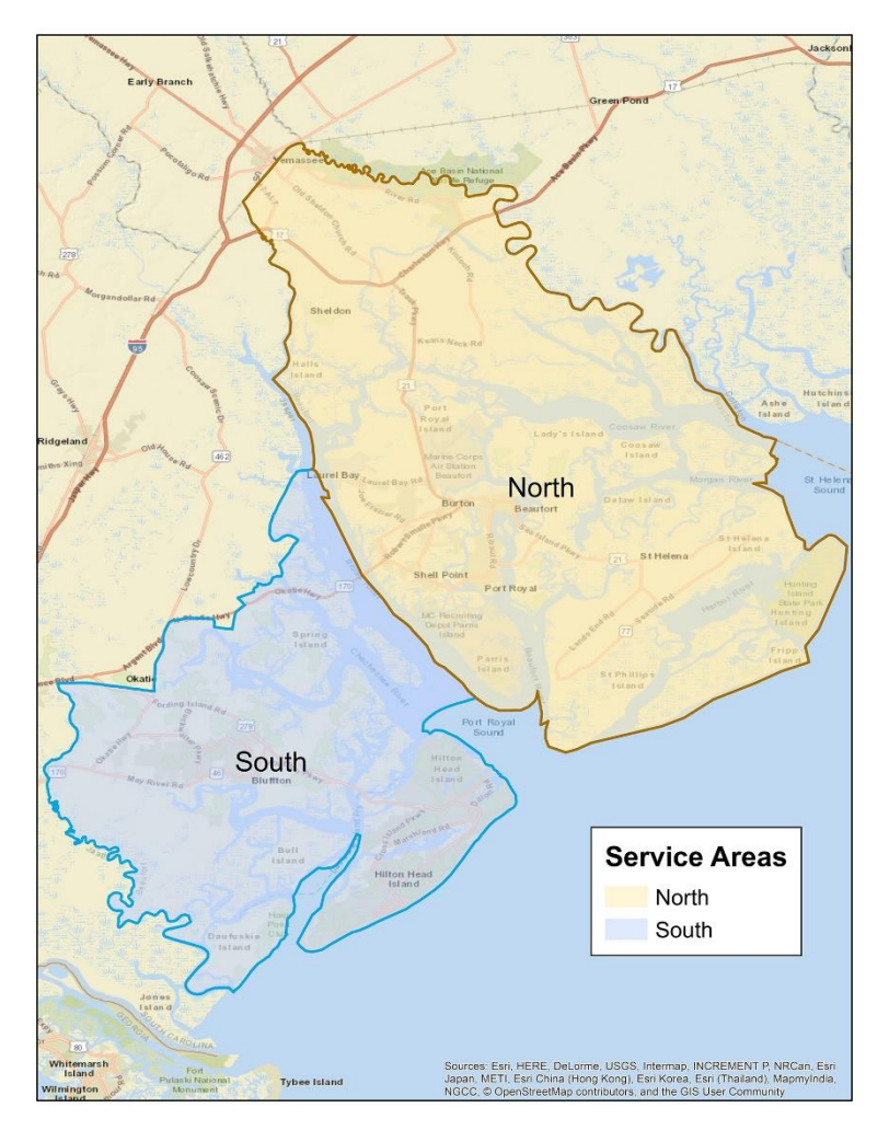
FIGURE 82-82: BEAUFORT COUNTY ROAD FACILITIES SERVICE AREAS

There are two service areas for the road facilities development impact fee: the South Beaufort County Road Facilities Service Area and the North Beaufort County Road Facilities Service Area. The South Beaufort County Road Facilities Service Area includes those parts of the County south of the Broad River. The North Beaufort County Road Facilities Service Area includes those parts of the County north of the Broad River. The boundaries of these services areas are identified in Figure 82-82: Beaufort County Road Facilities Service Areas.