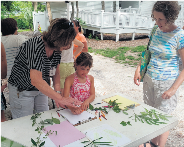
Master Gardener volunteers and budding gardeners have fun with plants during a Family Fun Day event at Honey Horn recently.

New residents may be unfamiliar with our area's plant materials or warm-season grasses that have different requirements than those grown farther north. If a homeowner is experiencing a problem with turf or ornamental plants, the Plant Problem Clinic can help. Samples are examined by specialists, and for $10, clients can receive a